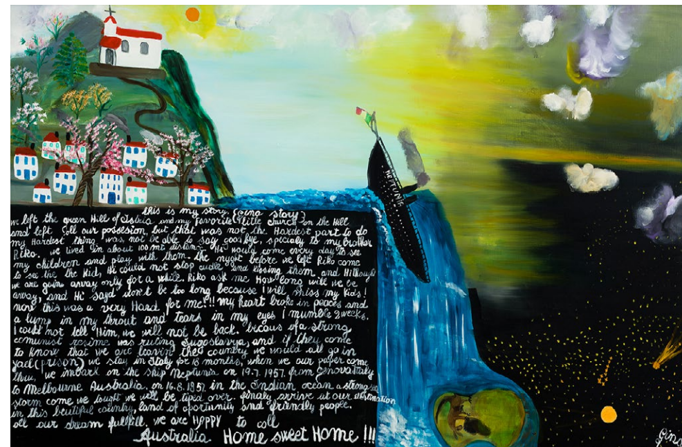
Our Story, 2004