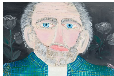
My Rose is Fading in the Dark, 2005

Big Ideas: Memories, Caring, Fear, Health