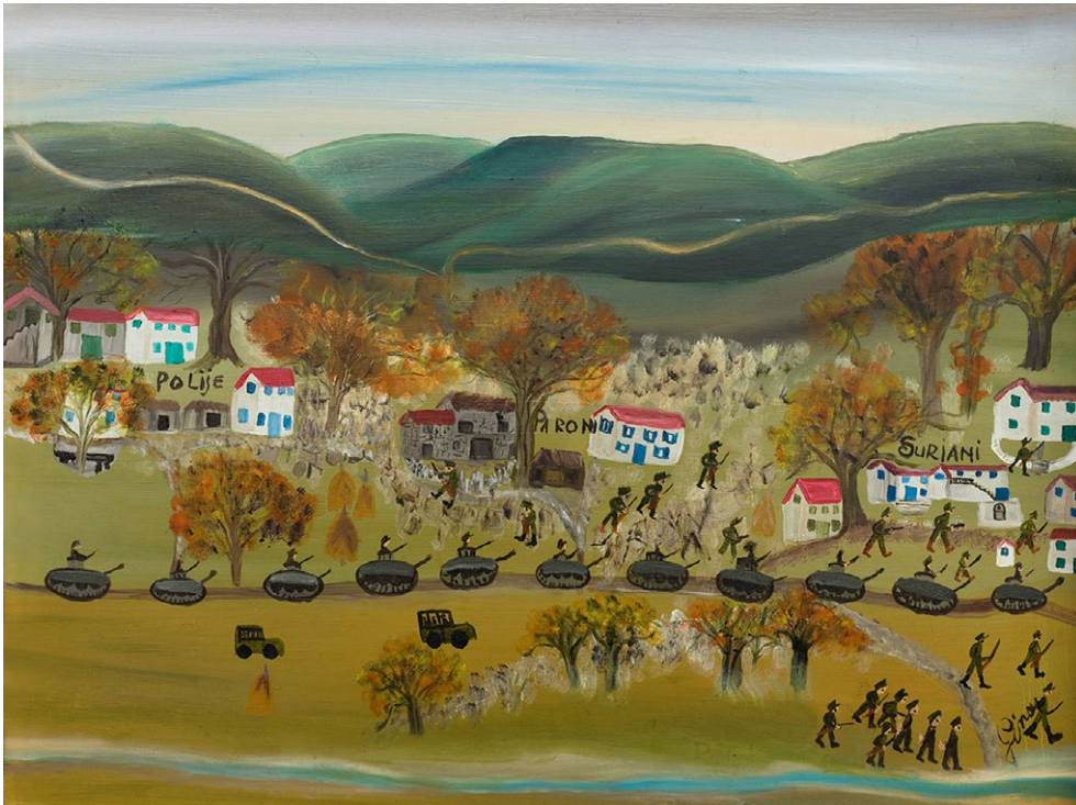
Germans in our Home, 2002