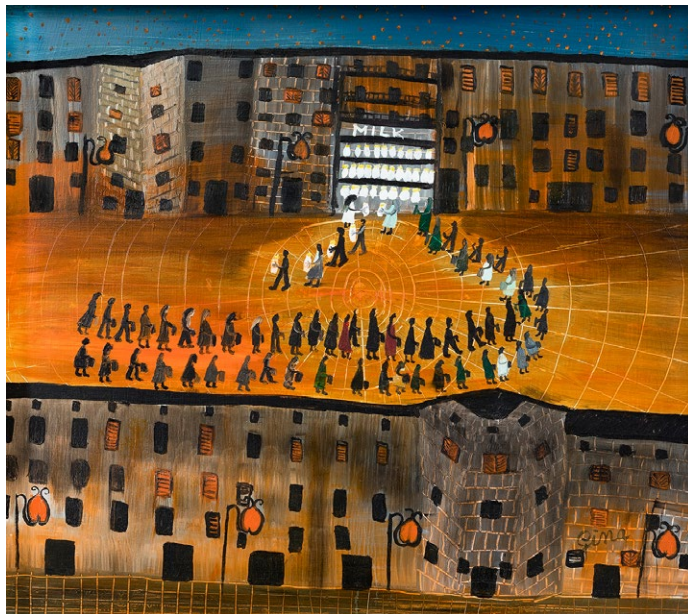
in this painting is true story. I been queing from 3 ocl. in the morning in very cold winter until 6. ocl the shop open for 1Lt of milk, 2002